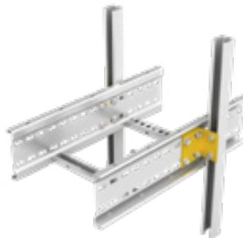
Speedway structural connecting bracket securing horizontal cable ladder to vertical channel support